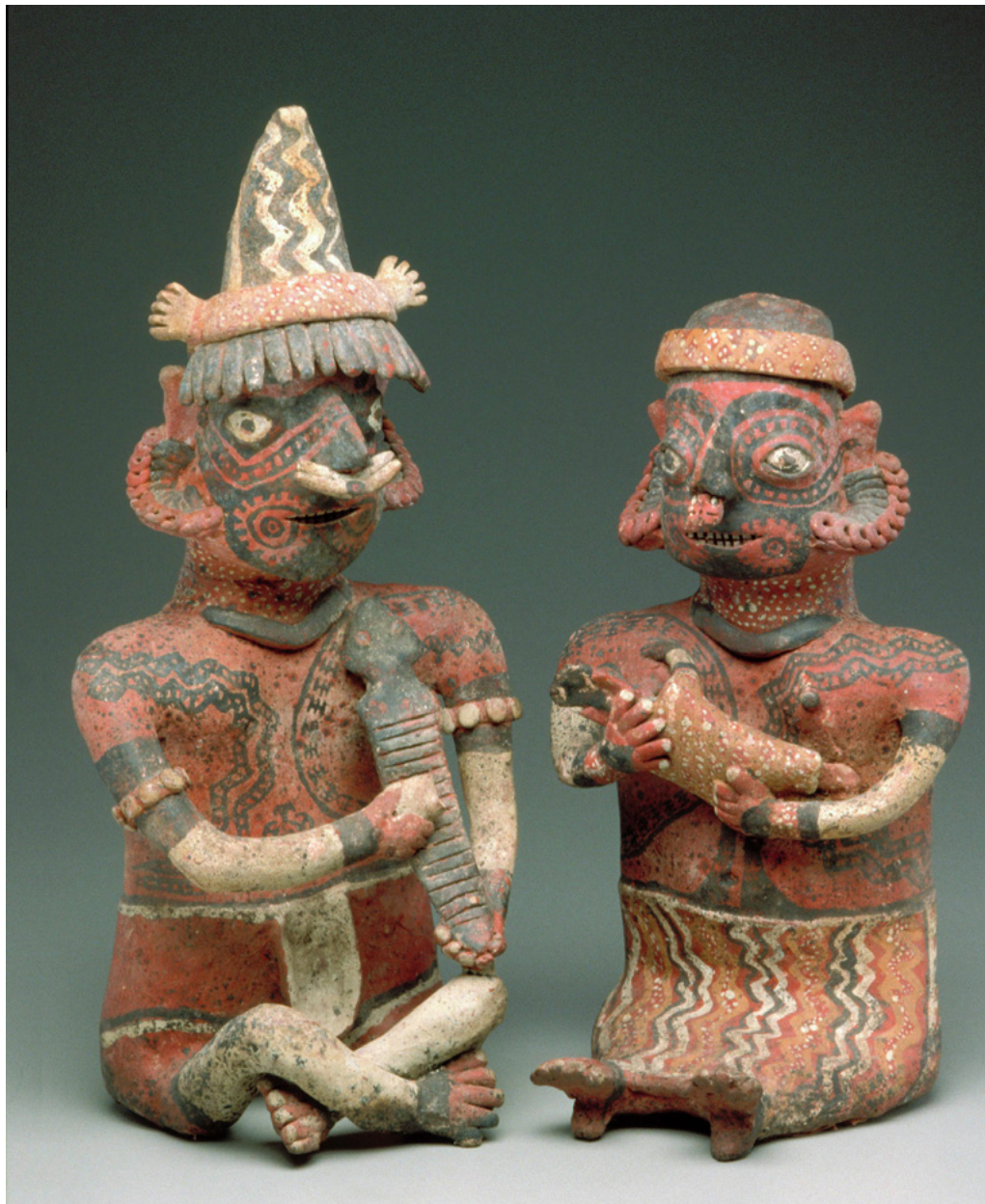
Male Figure , between 100 BCE and 400 CE, polychromed clay. Unknown artist, Nayarith, Precolumbian. Detroit Institute of Arts